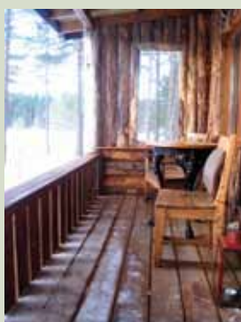
Above: The verandah of the Woodsman's Hut at Nethybridge.

There are no permitted development rights for huts. A planning application will be required for all hut developments and the application will provide details of what is proposed - including any decking, canopies or external toilets. If the planning authority has concerns, they may ask for changes or may refuse the application. However, the 2014 SPP does encourage local authorities to consider huts for recreational use, and it may be worth referring to this in your application. Unapproved changes to the design and construction may be subject to enforcement action or retrospective planning permission.