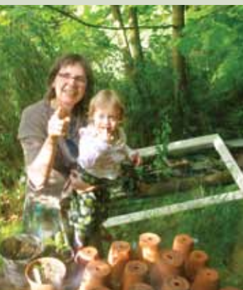
Carbeth hutters.