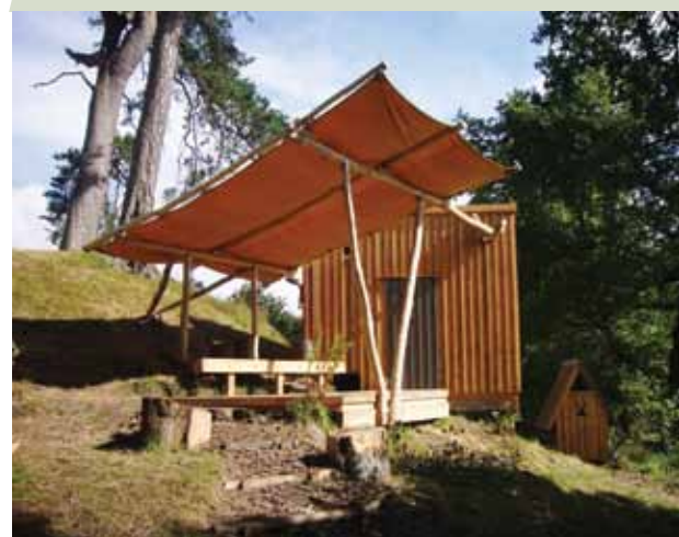
This example of a simple, off grid hut was designed by Alastair Baird. Compost toilet visible in the background.

At Carbeth the local authority collects waste from centralised collection points. However, council collections may not be feasible from small sites. Solutions will require to be tailored to suit individual sites. A workable solution must be found which minimises environmental impact. Any centralised collection areas should be screened to minimise the visibility of bins or refuse awaiting collection.