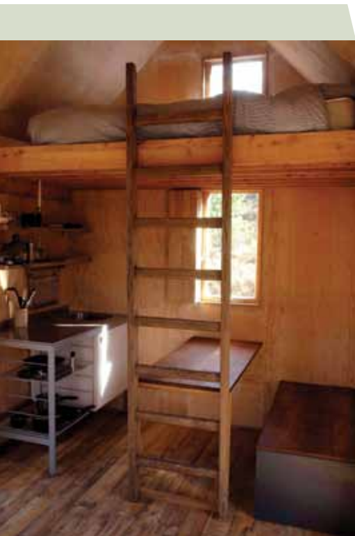
Interior of Inshriach Bothy - off grid for all services. Note the lack of taps!