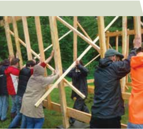
Hut building can be a great community-building activity.

Particularly on sites where there are a number of huts, there will be a need for the hutters or the landowner to manage the surrounding land or woodland to a good ecological standard to retain the quality of the natural environment. Good management of the woodland is also important to maintain the stability of trees near huts and to reduce the risk of windblow. Responsibility for this will again depend on the agreement between hutter and landowner, but, as stated above, in sites with more than a few huts, it may be advantageous to set up a Hutters' Trust to share responsibility for this.