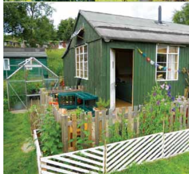
Traditional huts on the remaining hut sites dating back to the heyday of hutting in Scotland. From top: Stirling Council granted Carbeth Hut Site Conservation Status in recognition of its heritage value; A newly restored traditional hut at Eddleston near Peebles. Note the distribution of other huts on the hillside.