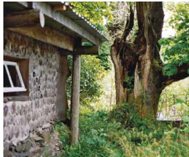
Hut sites work best with natural character retained as much as possible.

At Carbeth, Scotland's largest hut site, the huts are dispersed over a relatively large area, sometimes close together in groups and sometimes spread out. There is an informal, natural character to the place. Some of the huts do have a small garden around them, which often has a simple fence or hedge, however the overall natural character of the site is retained.