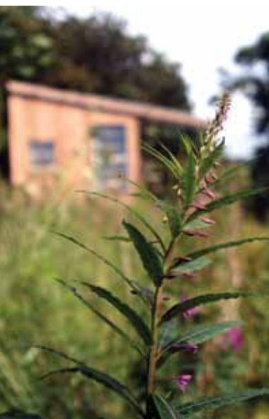
Huts should have a very low impact on the natural environment.

Developments falling within a description in Schedule 1 to the Town and Country Planning (Environmental Impact Assessment) (Scotland) Regulations 2011 19 always require environmental impact assessment. Development of a type listed in Schedule 2 20 to the Regulations will require environmental impact assessment if it is likely to have a significant effect on the environment, by virtue of factors such as its size, nature or location.