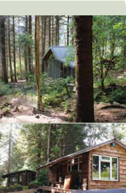
Above: A single hut in the woods; The distance between neighbouring huts at Carbeth varies widely.

Huts could be an appropriate form of development in a variety of accessible rural locations around Scotland. Decisions on location will be based on local and national planning policy. Access to public transport and walking and cycling routes is an important consideration for hut location.