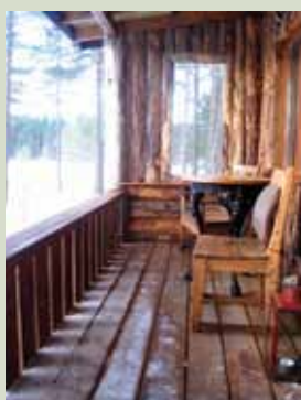
Above: The verandah of the Woodsman's Hut at Nethybridge.

There are no permitted development rights for huts. A planning application will be required for all hut developments and the application will provide details of what is proposed - including any decking, canopies or external toilets. If the planning authority has concerns, they may ask for changes or may refuse the application. However, the 2014 SPP does encourage local authorities to consider huts for recreational use, and it may be worth referring to this in your application. Unapproved changes to the design and construction may be subject to enforcement action or retrospective planning permission.