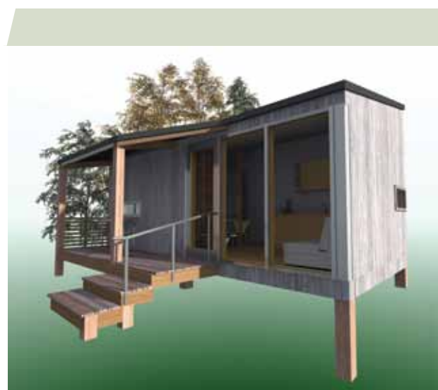
A vision of a contemporary hut by North Woods Design.

All planning decisions are made in accordance with development plans unless material considerations indicate otherwise (in accordance with Section 25 of the Town and Country Planning (Scotland) Act 1997). Hutterers should make themselves aware of relevant planning policy and the