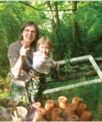
Carbeth hutters.