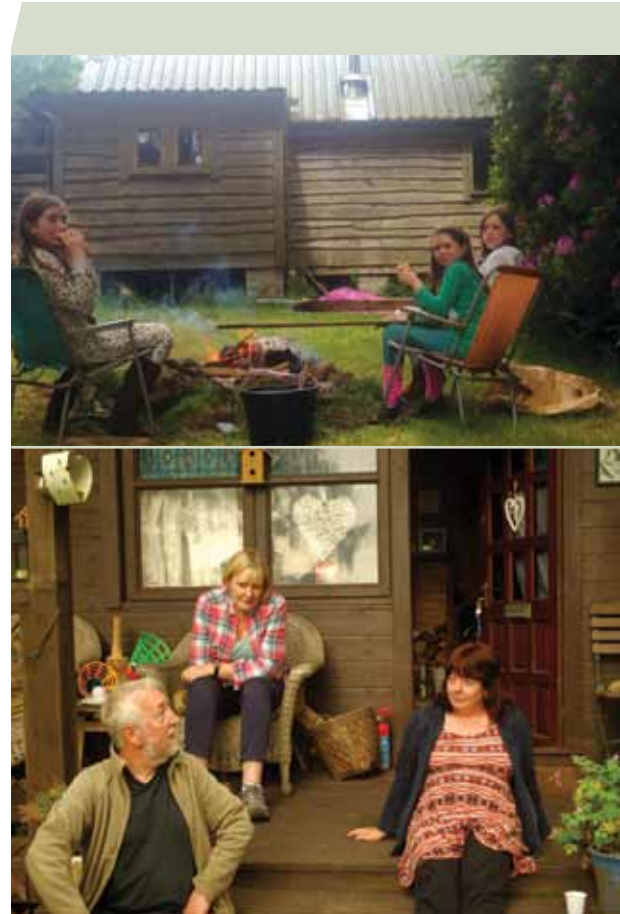
Some people want a hut so they can spend quality time with family and friends, others long for peace and solitude.

The SPP states that huts are for intermittent use and must not be principal residences. Hut sites tend to be self policing in this regard. However, planners will need to be satisfied that the site is not to be used for permanent residences. Planners may wish to consider using planning conditions, or possibly a Section 75 Planning Obligation, to safeguard this and prevent a site from changing to other, higher impact, uses. 12