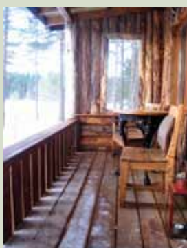
Above: The verandah of the Woodsman's Hut at Nethybridge.

There are no permitted development rights for huts. A planning application will be required for all hut developments and the application will provide details of what is proposed - including any decking, canopies or external toilets. If the planning authority has concerns, they may ask for changes or may refuse the application. However, the 2014 SPP does encourage local authorities to consider huts for recreational use, and it may be worth referring to this in your application. Unapproved changes to the design and construction may be subject to enforcement action or retrospective planning permission.