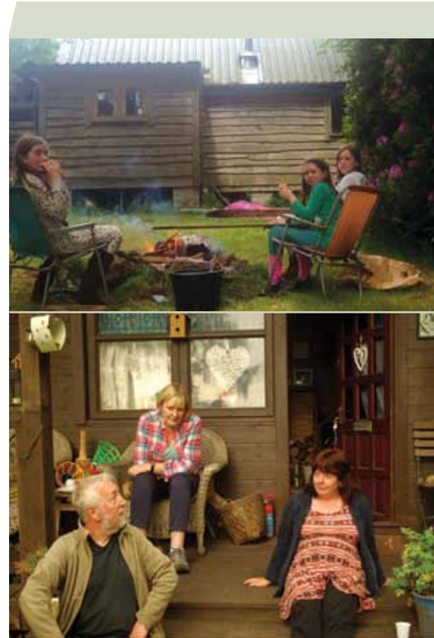
Some people want a hut so they can spend quality time with family and friends, others long for peace and solitude.

The SPP states that huts are for intermittent use and must not be principal residences. Hut sites tend to be self policing in this regard. However, planners will need to be satisfied that the site is not to be used for permanent residences. Planners may wish to consider using planning conditions, or possibly a Section 75 Planning Obligation, to safeguard this and prevent a site from changing to other, higher impact, uses. 22