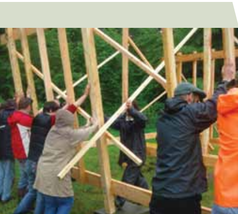
Hut building can be a great community-building activity.

Particularly on sites where there are a number of huts, there will be a need for the hutters or the landowner to manage the surrounding land or woodland to a good ecological standard to retain the quality of the natural environment. Good management of the woodland is also important to maintain the stability of trees near huts and to reduce the risk of windblow. Responsibility for this will again depend on the agreement between hutter and landowner, but, as stated above, in sites with more than a few huts, it may be advantageous to set up a Hutters' Trust to share responsibility for this.